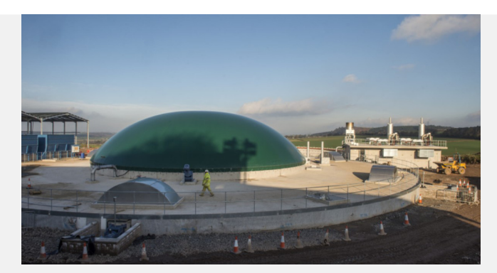
One of the 48m diameter Tanks in which the silage is broken down to produce gas fuel which is burnt to heat water. The resulting steam powers turbines to make electricity.

There is no need to allow for steel cutting and fixing in the construction schedule.