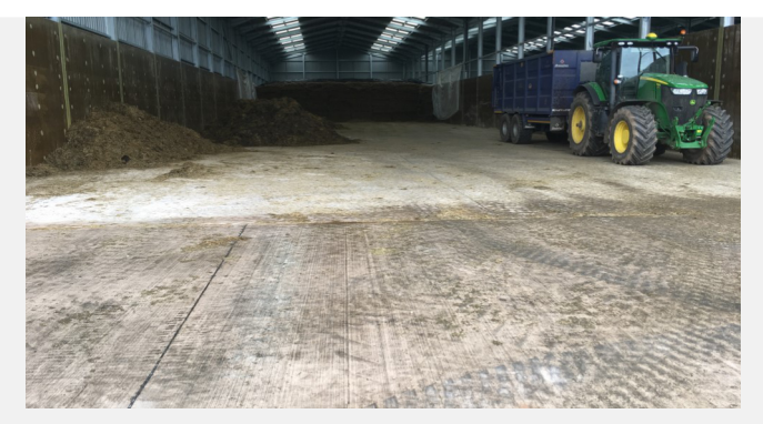
With the elimination conventional Steel Mesh, large strips pours can be completed, allowing quicker construction.

By replacing the steel fabric with inert DURUS S400 polypropylene macro fibres, the risk of a shortened service life resulting from steel corrosion was eliminated.